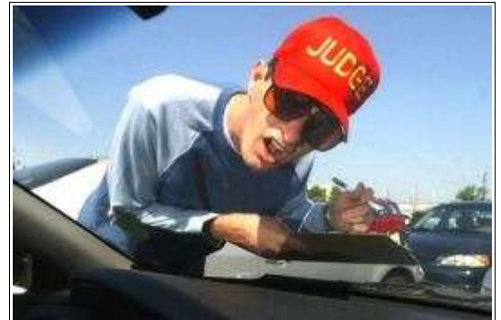
The original concept for the TV series "JAG" involved Bryce Donovan wearing this annoying hat 24-hours a day. (The understated sunglasses were his idea.)

I figured it would be something like, "If a Jaguar has Cadillac emblems or a different-colored door, take a point off. You know, if you feel like it." Instead, I walked into a room filled with a bunch of crotchety old guys arguing over which exhaust manifold porcelainized or nonporcelainized should go on a 1969 Series 2 E-Type. (Answer: It's a trick question. Early models had black-enameled exhaust manifolds. Ha!)